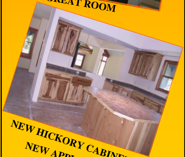
NEW HICKORY CABINETS NEW APPLIANCES